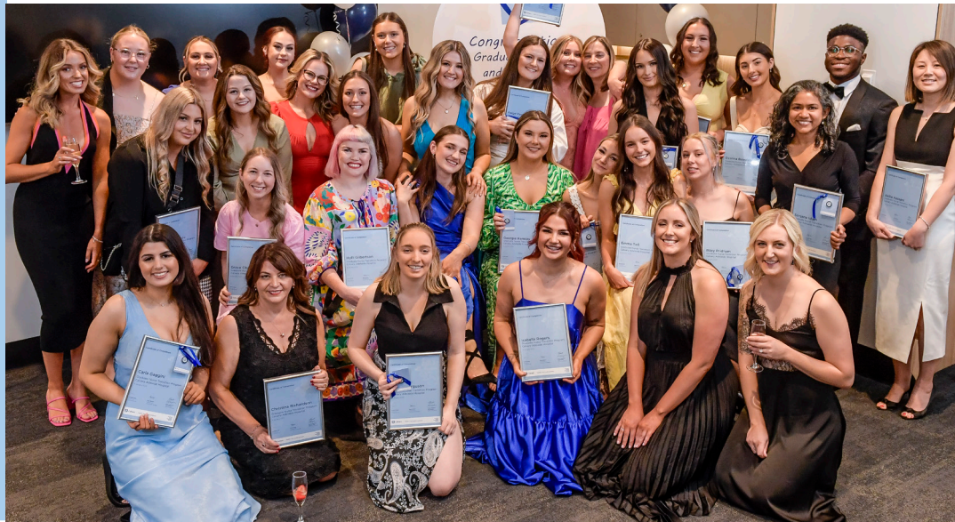
Calvary Adelaide Hospital 2022 GNTTP cohort at their graduation. January 2023