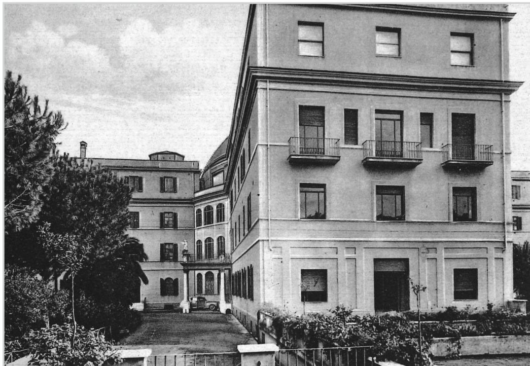
Calvary Hospital, Mother House, Rome, founded 1907.