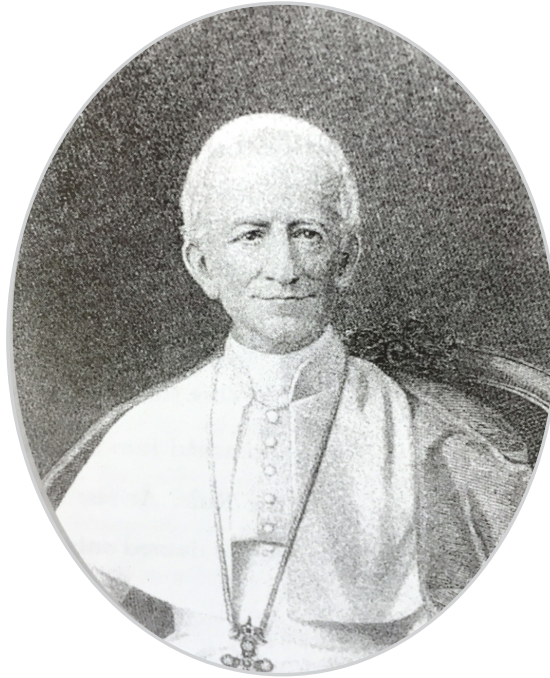
His Holiness Pope Leo XIII.