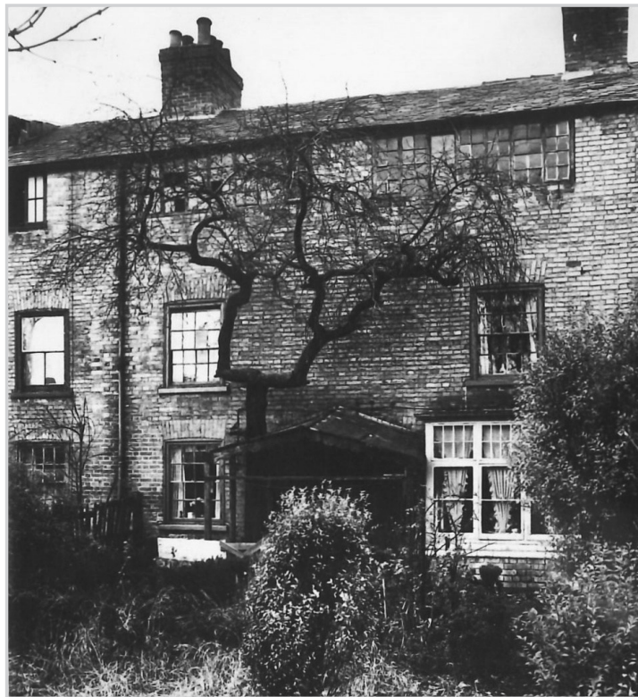
The old pear tree in the garden of Hyson Green Convent.