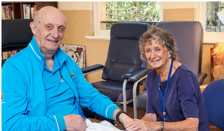
Above: Each day our volunteers spend time with patients on the wards and outpatient clinics

"I am retired but still feel useful. It's nice to be able to give something back."