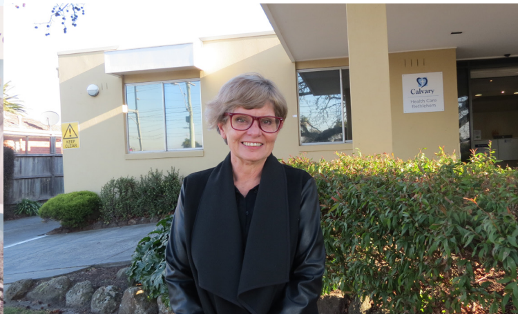
Above: Volunteers also assist the organisation with advisory support

The work performed by volunteers is valued by patients, residents and families and the staff whose work they complement.