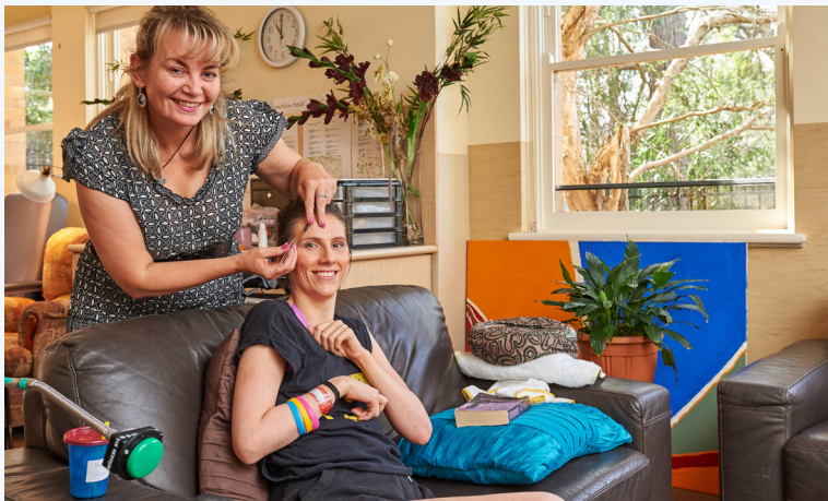
Above: The manicures and gentle massage offered by volunteers are greatly appreciated by patients