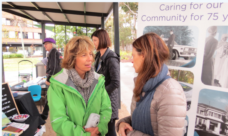
Above: Volunteers also help with community events throughout the year