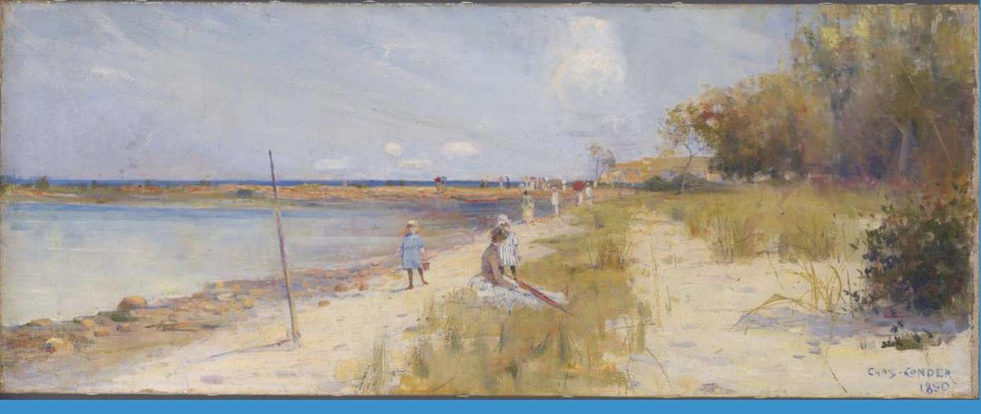
Rickett's Point, Beaumaris: Home of the Bunerong people of the Kulin Nation Australian Impressionism: Rickett's Point by Charles Conder (1890) Purchased in 1951 by National Gallery of Victoria

Arts And Health = AAH! an exclamation of surprise, amazement, wonder or joy! Research shows us that experiencing or participating in art and culture is great for our health.